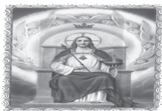
Christ, our King