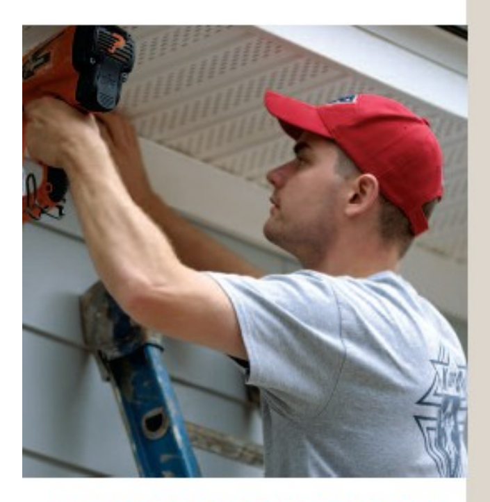
"It will be a shelter and shade from the heat of the day, and a refuge and hiding place from the storm and rain."

The Knights of Columbus support the mission of Habitat for Humanity, which not only helps people to become homeowners, but also actively involves them in the process. This teaches valuable skills, develops confidence and provides experience. Millions of dollars and millions of hours given in earnest by the Knights has meant shelter for deserving families across the country.