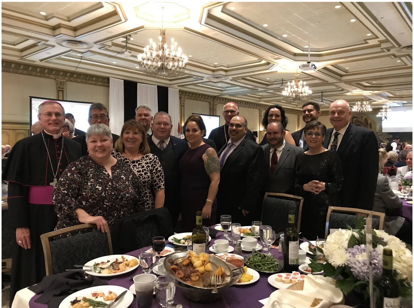
16th Annual Bishop's Dinner Windsor - Essex held at the Ciociaro Club on Thurs Oct 24, 2019.