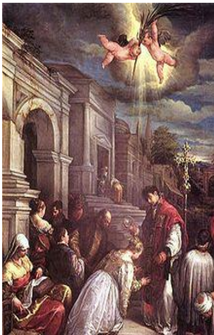
Saint Valentine baptizing Saint Lucilla by Jacopo Bassano