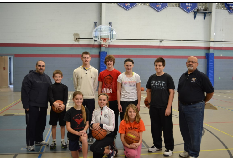
Council Free Throw on Saturday February 2, 2013